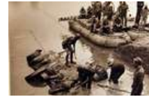
Cumberland University during World War II