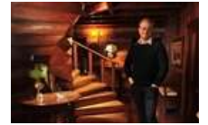
Lebanon home rich with history